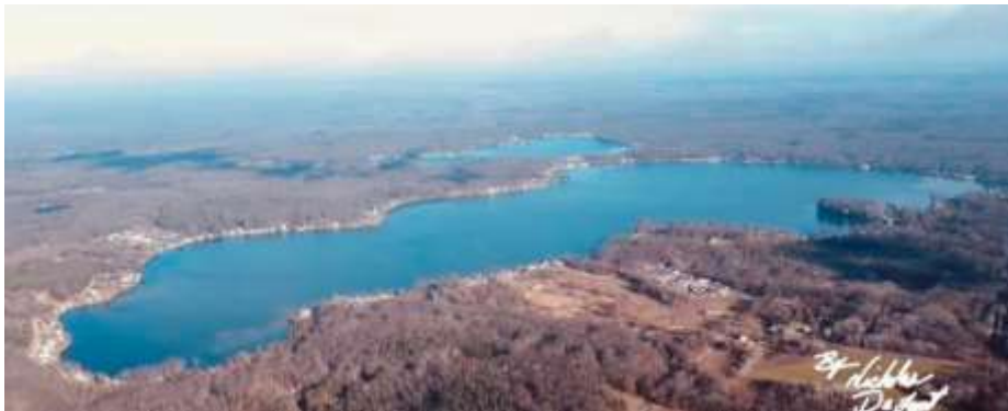
Arial

In addition to in-lake work, an assessment was completed last year to evaluate the causes of erosion that have long been an issue on Wheeler Drain. Measures to control and stabilize severely eroded stream-banks are now being considered for two road crossings. This work would be coordinated by the Muskegon River Watershed Assembly. The lake board continues to remain in contact with the United States Geological Survey, the Michigan Department of Natural Resources, and the Michigan Department of the Environment, Great Lakes, and Energy regarding ongoing management activities on Hess Lake.